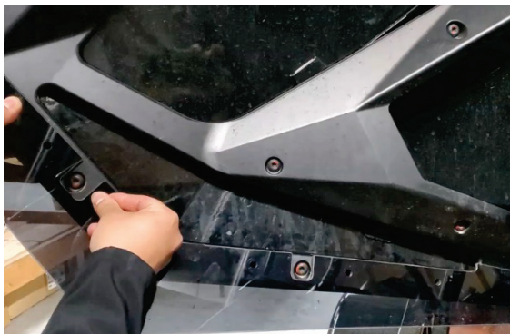
Figure 1: Line up the holes in the valance with the factory-drilled holes