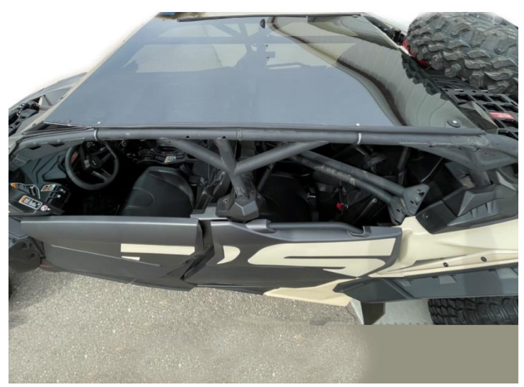
Top View (Rear of Vehicle)